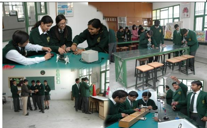
SCIENCE LAB PHOTO