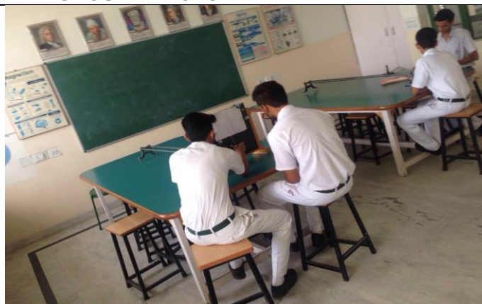
PHYSICS LAB PHOTO